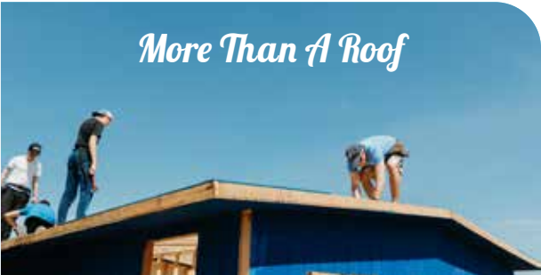
More Than A Roof

We want to extend our thanks for the support you have provided to our More than a Roof Campaign in 2021. Your gifts have made a true difference in the lives of the families in San Quintin! Gracias! Our goal for the year was to build 10 houses for families in need.