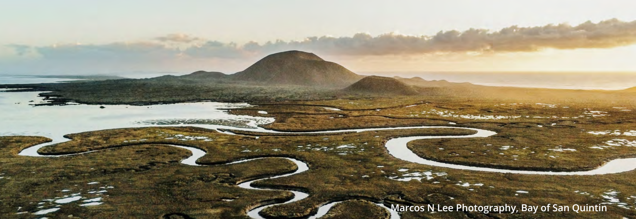
Bay of San Quintin